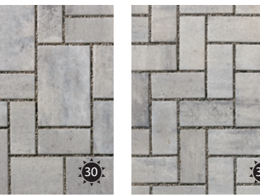
MARBLE GREY Herringbone